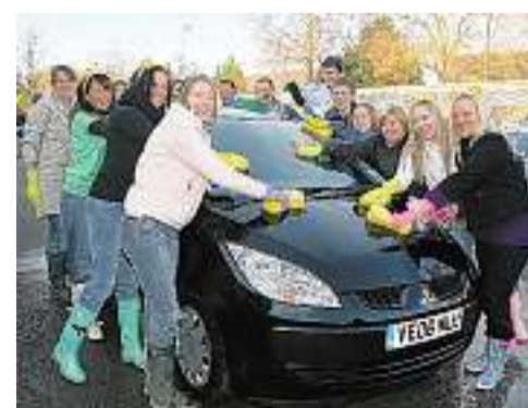
CAR WASH: members of the legal and compliance team washed cars for CIN